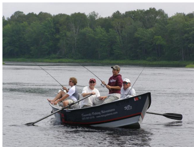
Penobscot River Float Trip

We got virtually no rain from early August until mid October, so on many streams, the late season landlocked salmon runs didn't materialize until after the season closed. Therefore, most of my September fishing was focused on pond brook trout. Fall provides a wonderful combination of nice weather, no bugs and great foliage, and is one of the nicest times of the year to fish in Maine. I feel really blessed to have an opportunity to fish as much as I do, and to share these experiences with so many great people. Please come and join me for a day on the water soon.