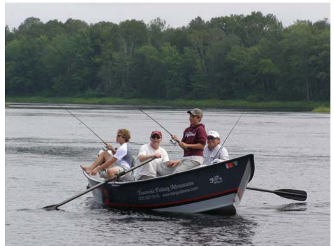
Penobscot River Float Trip

We got virtually no rain from early August until mid October, so on many streams, the late season landlocked salmon runs didn't materialize until after the season closed. Therefore, most of my September fishing was focused on pond brook trout. Fall provides a wonderful combination of nice weather, no bugs and great foliage, and is one of the nicest times of the year to fish in Maine. I feel really blessed to have an opportunity to fish as much as I do, and to share these experiences with so many great people. Please come and join me for a day on the water in 2010.